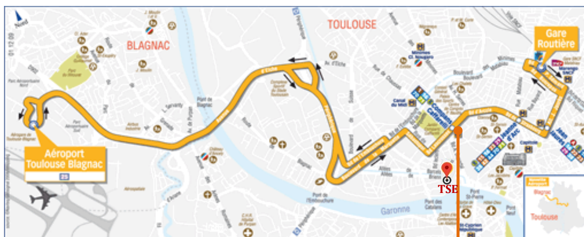
Bus stop Compans

The bus stop is in front of door C on ground level (arrival level) Airport shuttle leaving every 20 minutes to bus stop « Compans Caffarelli » Fare: Single fare: 8 €