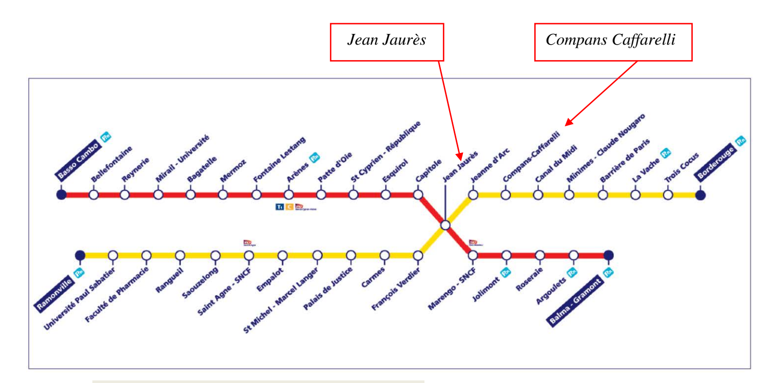
Map of Toulouse