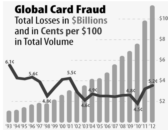
Fig. 2. Losses from card fraud

Bitcoin as a payment system does not rely on centralized institutions either. Each user is able to send and receive Bitcoins on his own without financial intermediaries. As a result, payments in Bitcoin are irreversible and cannot be revoked. With regards to e-commerce, Bitcoin as a payment system provide several advantages. Due to its peer-to-peer nature and independence of financial intermediaries, the Bitcoin technology generally facilitate trade. In particular, e-commerce involving cross-border transactions benefits from Bitcoin not being bound to specific countries. Besides, virtual currencies also enable consumers without access traditional payment systems, e.g. credit cards or banking services, to participate in e-commerce. With Bitcoin, there is no credit card number that a malicious actor can collect in order to impersonate someone. In fact, it is even possible to send a payment without revealing one's identity, almost like with physical money.